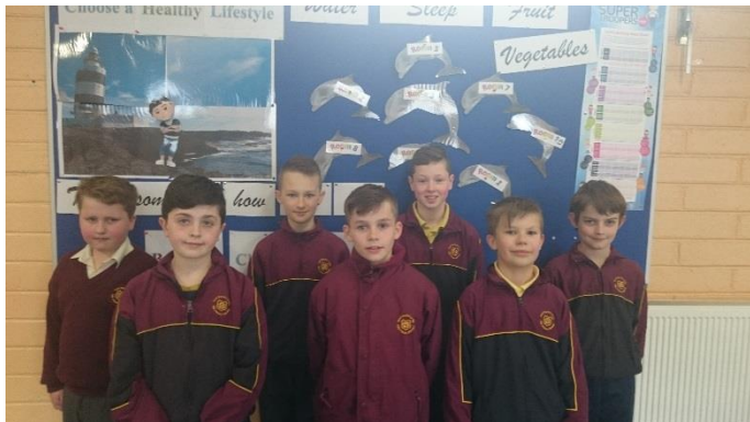
Healthy Lunch-box winners for March.