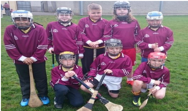
3rd/4th Class Cup Runners Up 2017