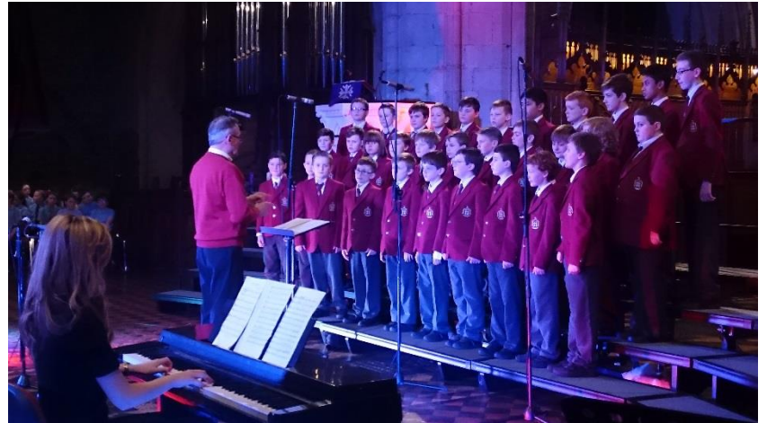
CBS Boys' Choir Visit Poland May 2017

The choir having performed so well at the Three Tenors concert in St Mary's Cathedral at Christmas, I am pleased to say that the younger "Confirmation Choir" sang equally well at the recent Confirmation there.