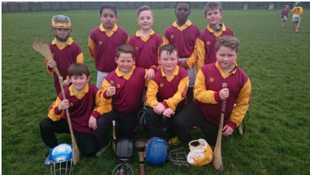
3rd/4th Class Shield Winners 2017