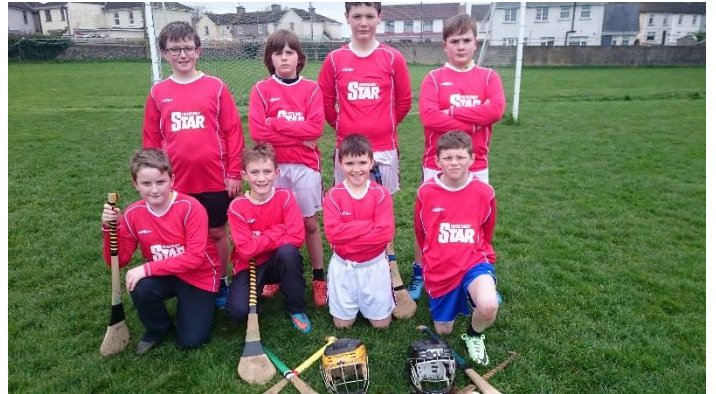
Winners of the Winter League Cup Final – Galway