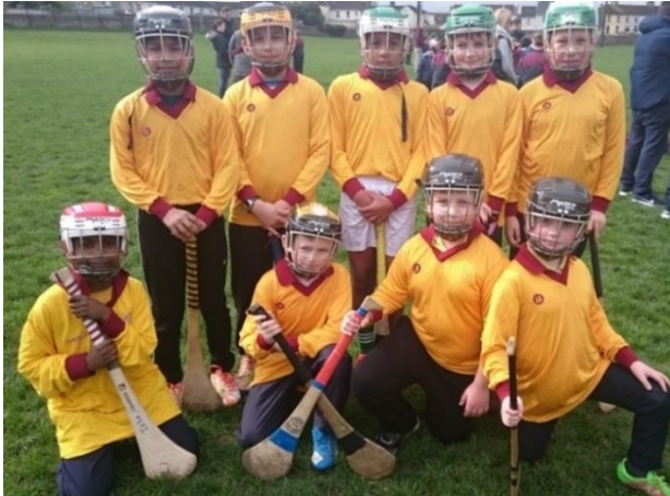
3rd/4th Class Cup Winners 2017