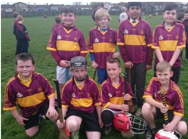
3rd/4th Class Shield Runners Up 2017