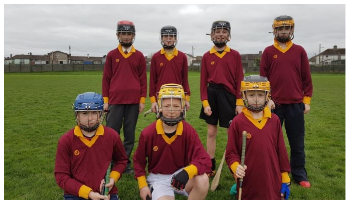
Runners Up of The Winter League Shield Final

Congratulations to everyone who took part.