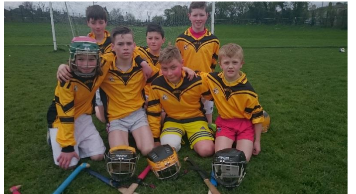
Cup Runners Up, Clare who lost by the narrowest of margins.