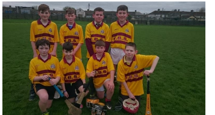
Winners of The Winter League Shield Final