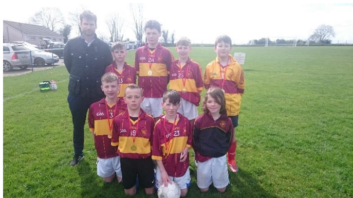
'A' Team County Champions.