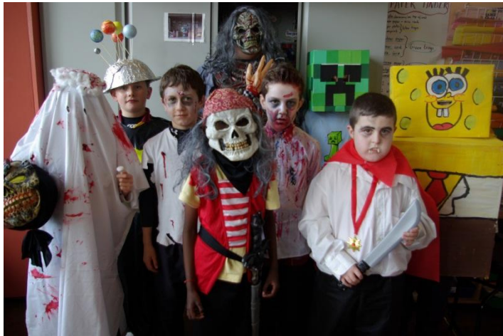
Prize Winners Rooms 1 - 9

On Friday, 26 th October all classes were allowed to dress up in costumes for our Hallowe'en Party 2012. The boys got to watch a film, play games and eat lots of party treats which were provided by the school. The winners of “Best Dressed” pupil in each class were then rewarded with lovely prizes also provided by Mr. O'Reilly.