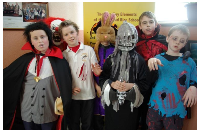
Prize Winners Room 10

Each boy brought in €2 which went towards much needed school funds.